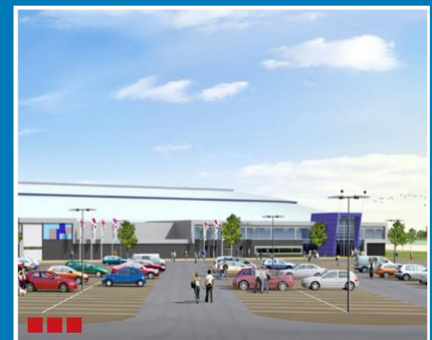
Go Planet Park