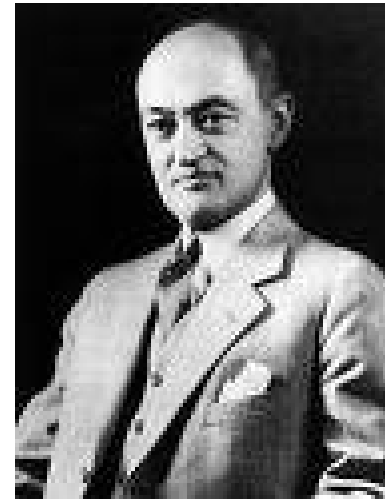
Joseph Schumpeter (1883-1950)